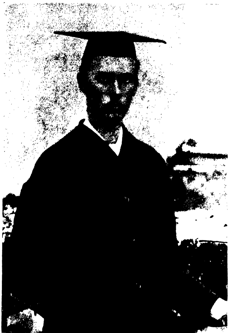
J. C. SMUTS, STELLENBOSCH, 1889