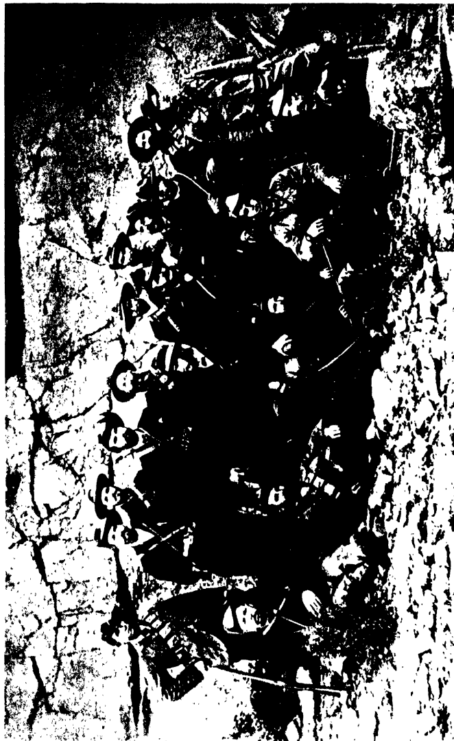
COMMANDO, APRIL 1902