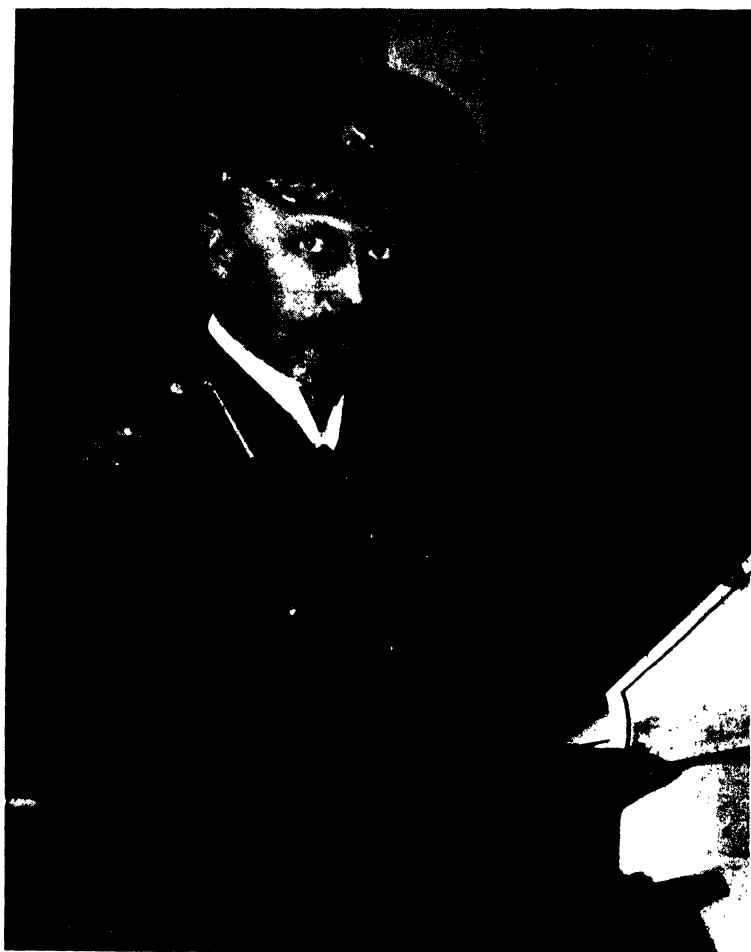
J. C. SMUTS, EAST AFRICA, 1916