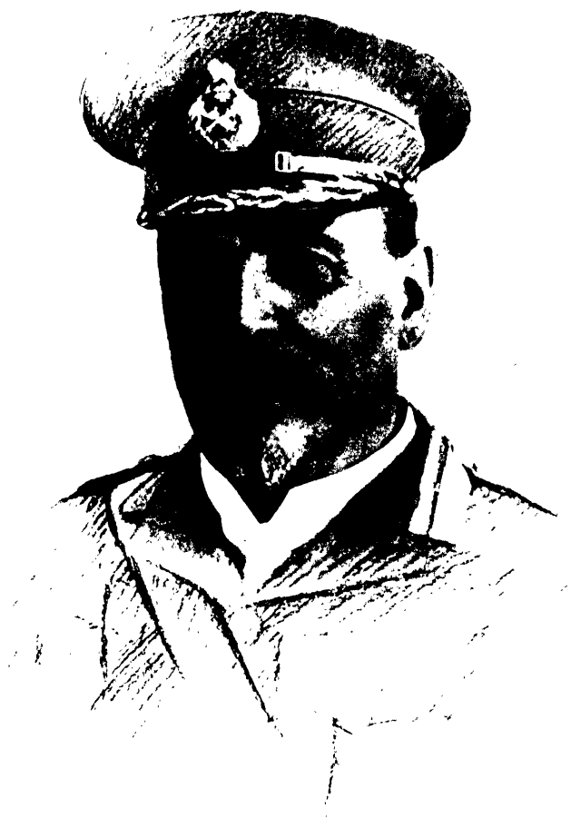
LOUIS BOTHA, 1915