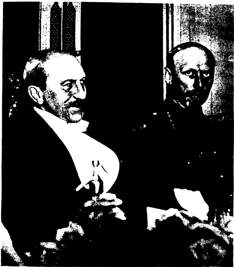
J. C. SMUTS AND LORD MILNER, LONDON, 1917