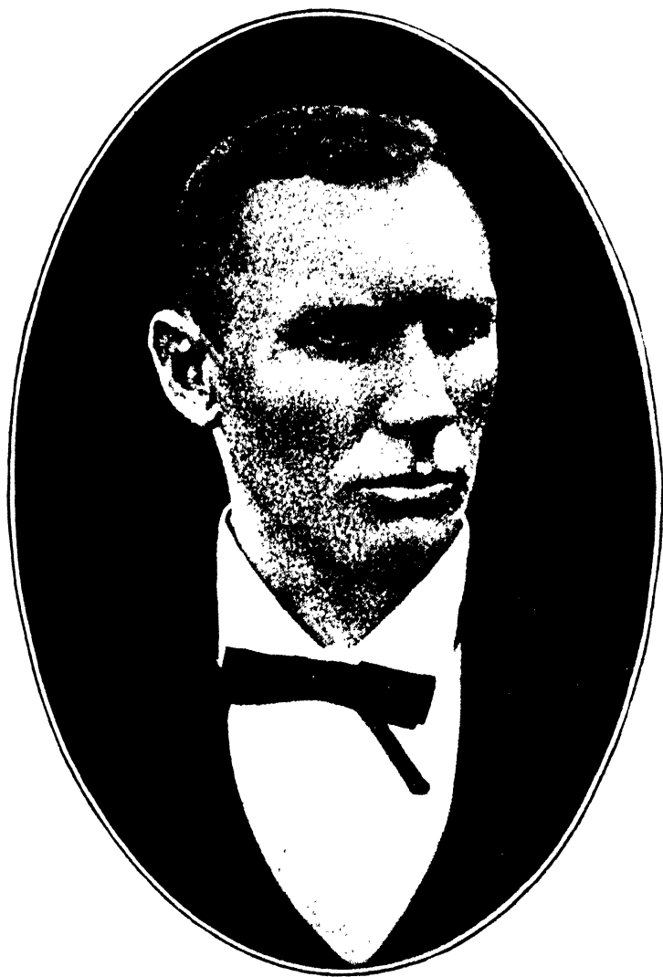
J. C. SMUTS, PRETORIA, 1899