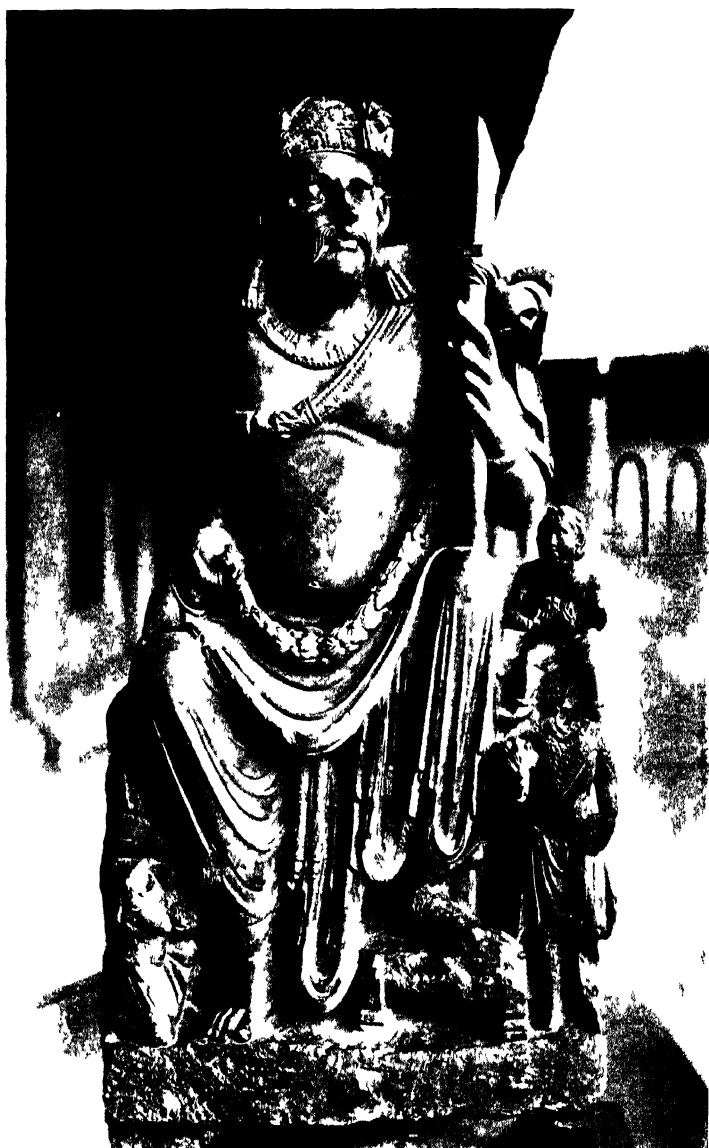
Kuvera. (From an Indo-Greek sculpture)