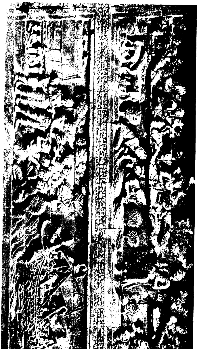
A Hindu ship arriving at Java