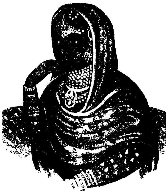
Maharani Jind Kaur (1816-63)