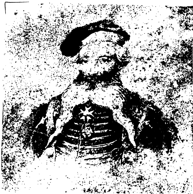
General Allard (1785—1839)