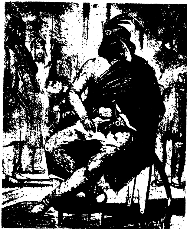
Maharaja Sher Singh (1806—43)