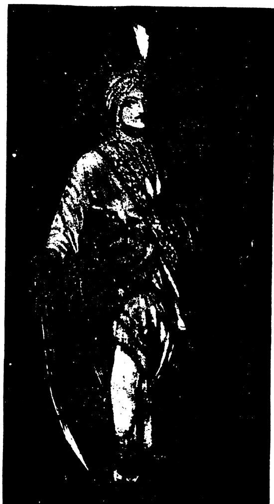
Maharaja Duleep Singh (1837-1893)