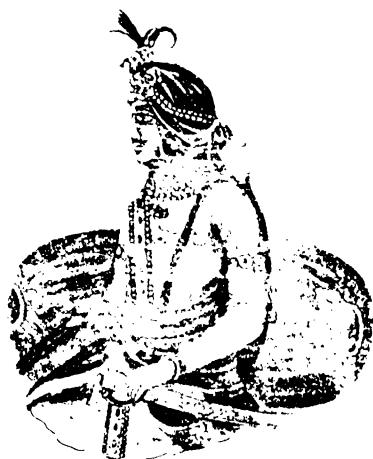
Kanwar Nau Nihal Singh (1820—1849)