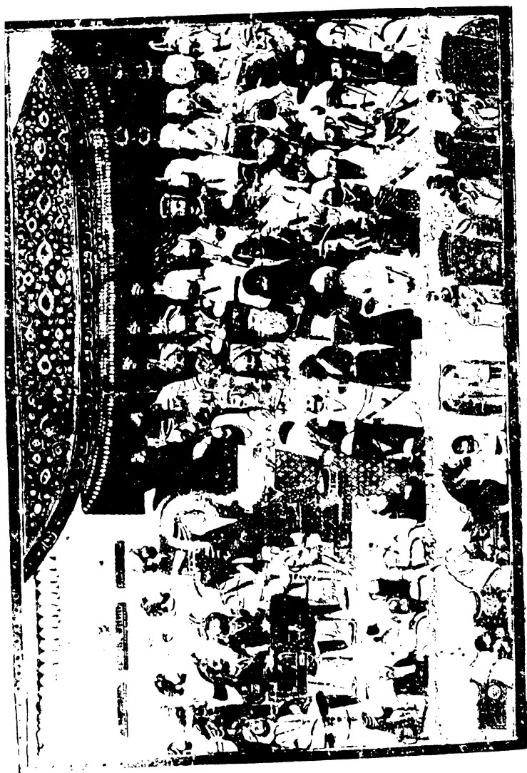
DARBAR OF MAHARAJA RANJIT SINGH