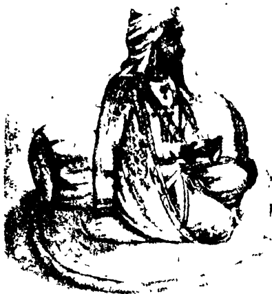
Maharaja Kharak Singh (1801-1840)