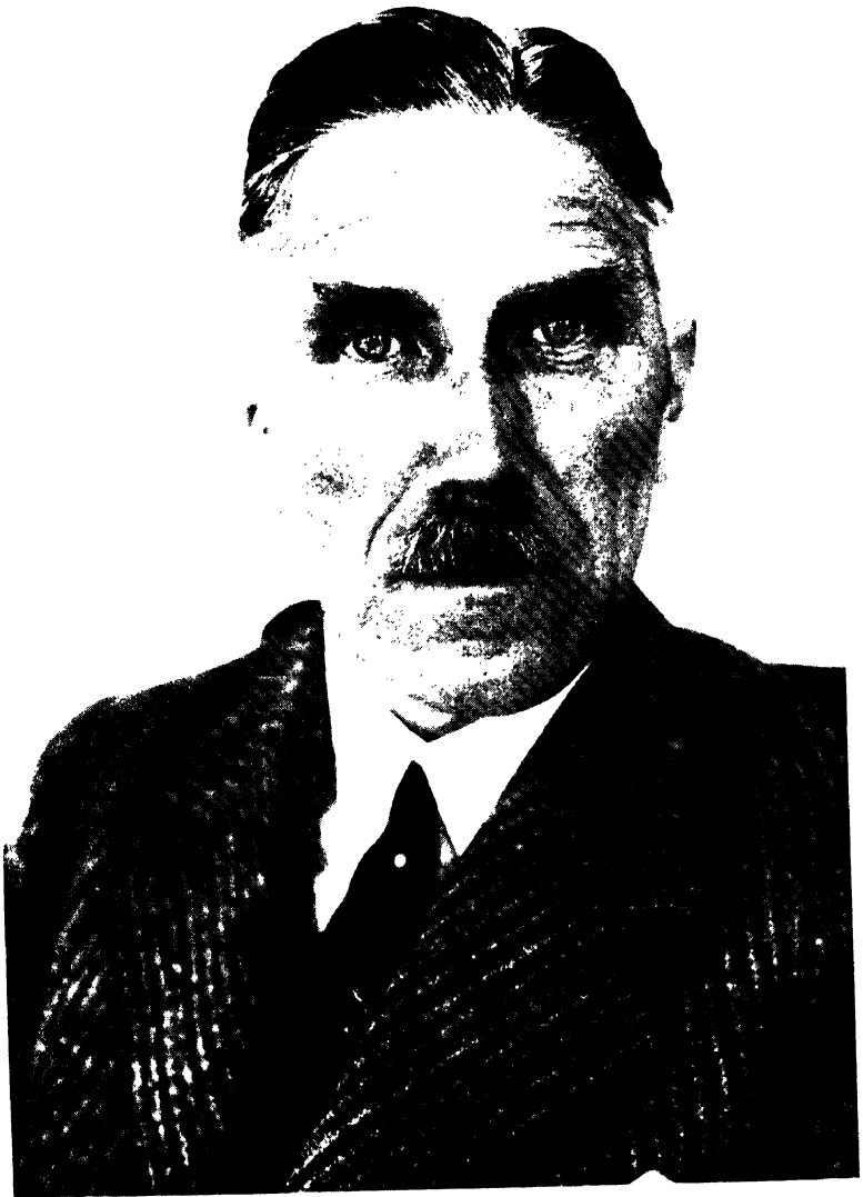
FRANZ VON PAPEN