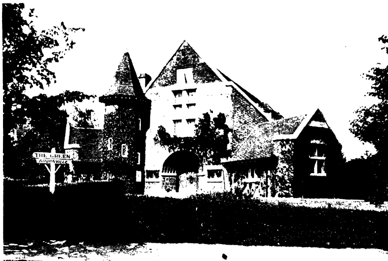
FRIENDS' MEETING HOUSE, BOURNVILLE