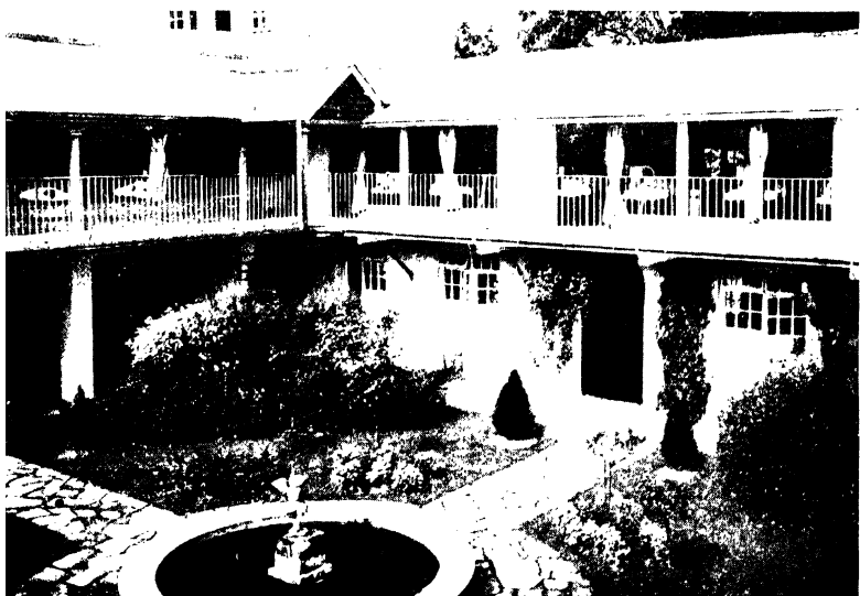
THE CRIPPLES' HOME: AN OPEN-AIR EXTENSION