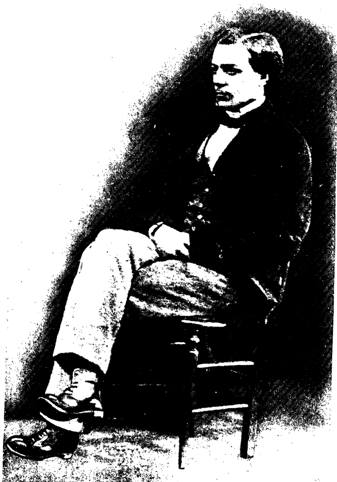
GEORGE CADBURY AT THE AGE OF 18