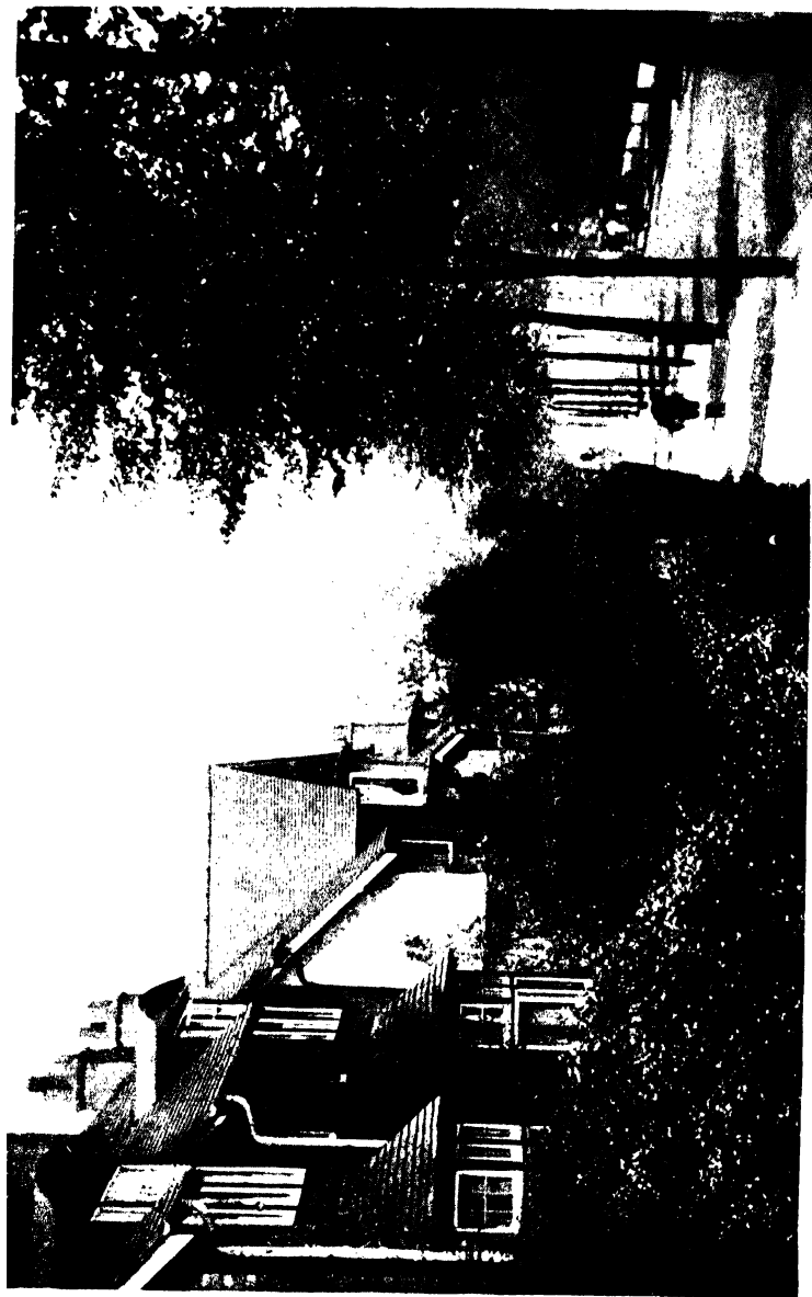
LINDEN ROAD, BOURNVILLE