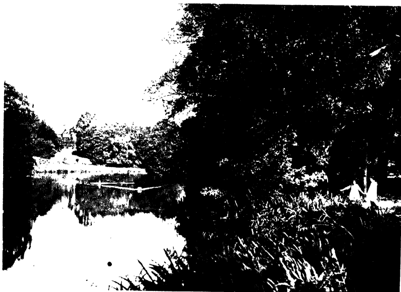
THE MANOR HOUSE, NORTHFIELD