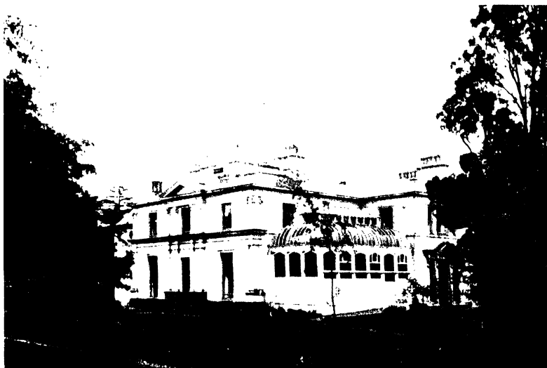
THE CRIPPLES' HOME (WOODLANDS)