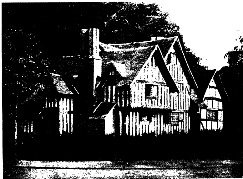
SELLY MANOR (Re-erected in Bournville)