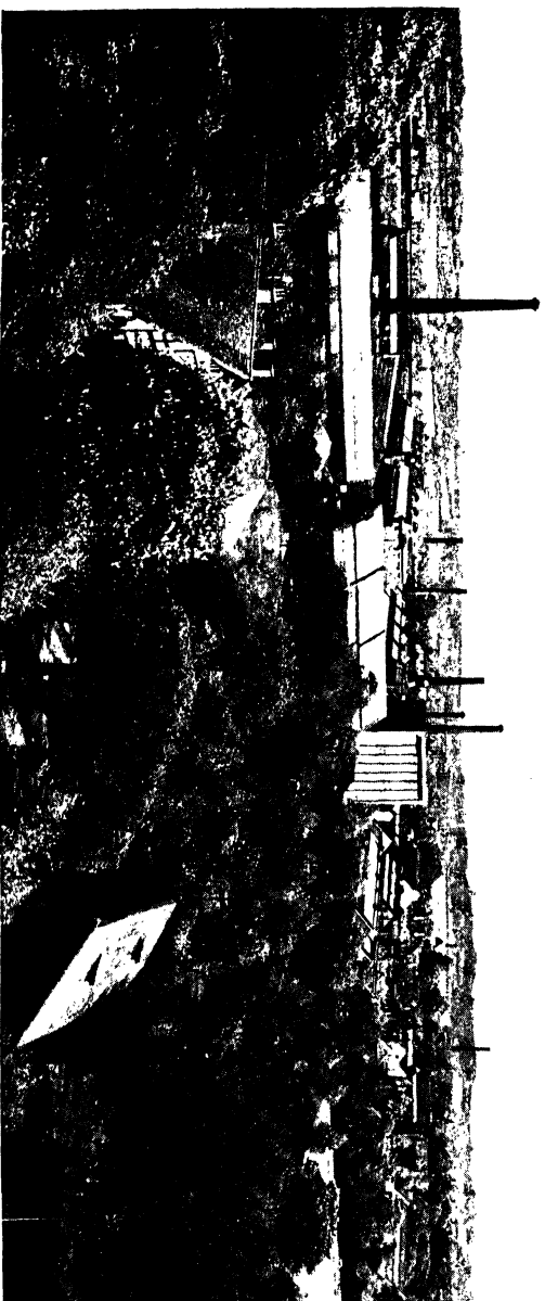
THE BOURNVILLE WORKS