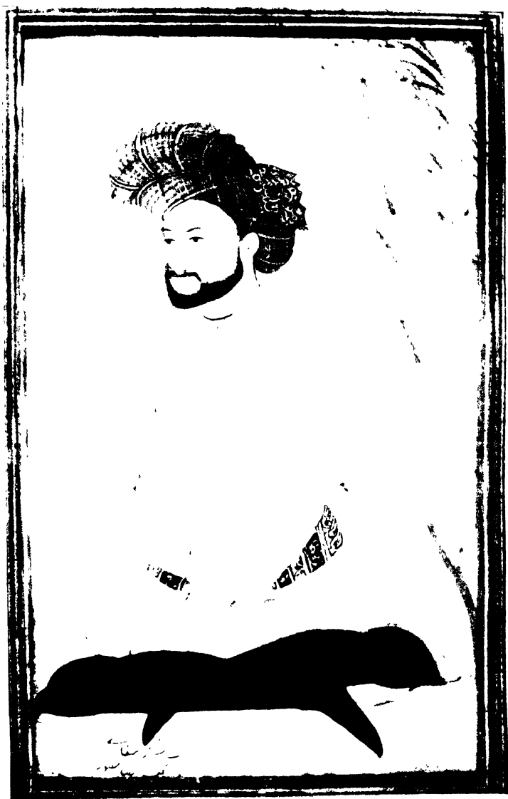
SHAH ĀL, POET AND PHYSICIAN