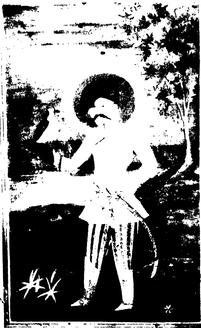
SHAH ABBAS THE GREAT