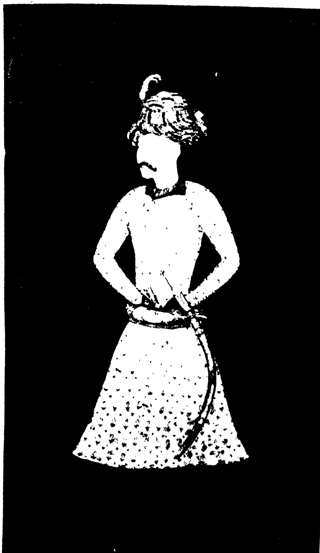
SHAH ABBAS THE SECOND