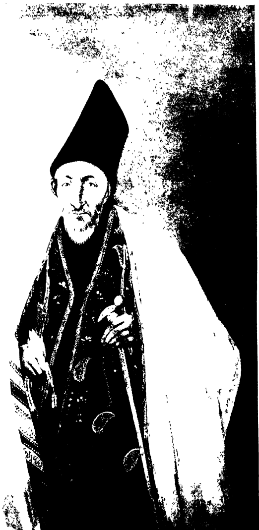
HAJJÍ MÍRZÁ ÁQÁSÍ