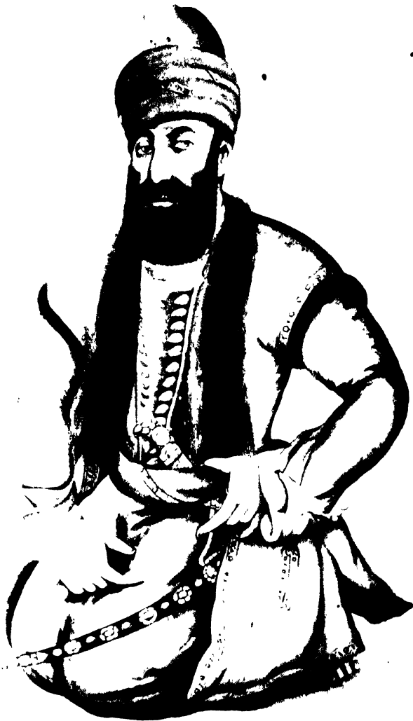
KARIM KHAN ZAND