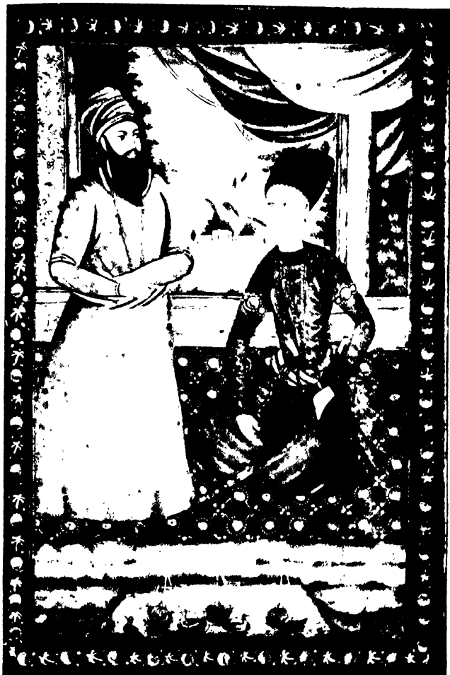
AQA MUHAMMAD KHÂN QAJAR seated, with his minister HAJJI IBRAHÎM standing before him