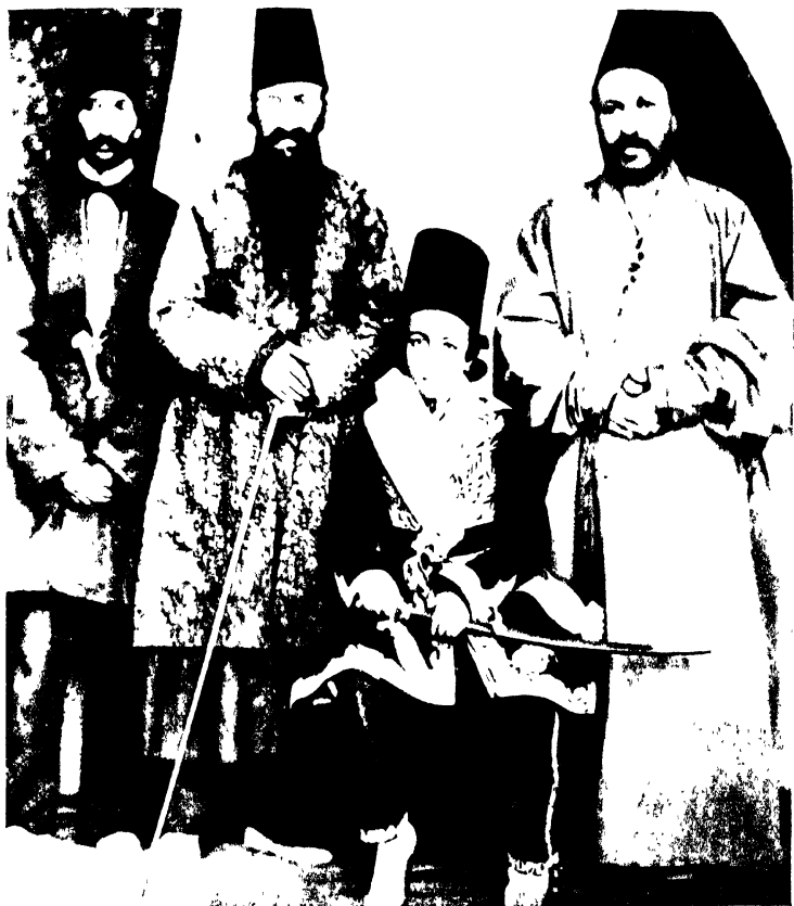
MUẒAFFARU'D-DÍN MÍRZÁ (afterwards SHÁH) seated, with his tutor ( Lala bāshī ) RIDÁ-QULÍ KHÁN, poet and historian, standing on his right (the reader's left)