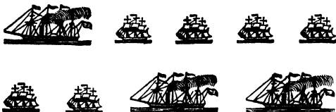
Battle of Lake Erie ( see remarks , p. 96).