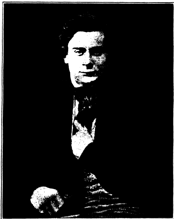
From a Daguerrotype made in 1846