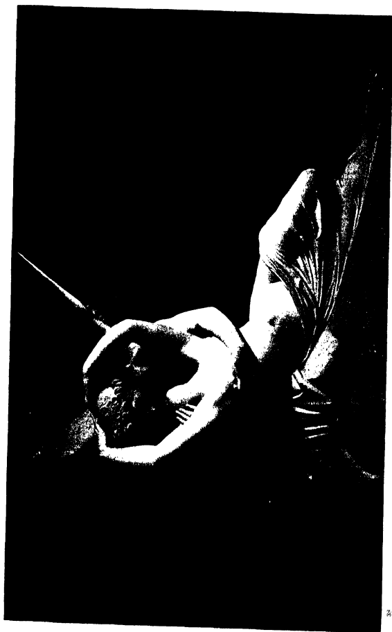
Point-crash by Brecht