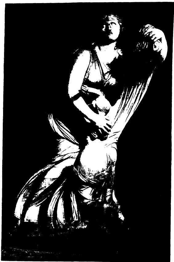
NIOBE in the Uffizi Gallery, Flo