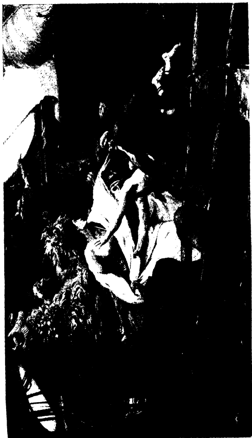
THE GOLDEN FLEECE