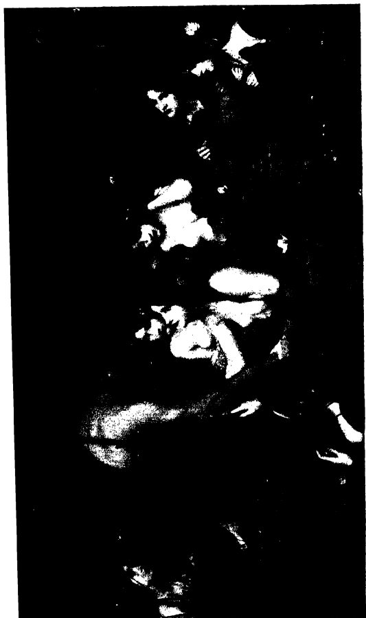
HYLAS AND THE WATER NYMPHS