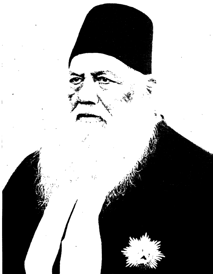
SIR SYED AHMED KHAN