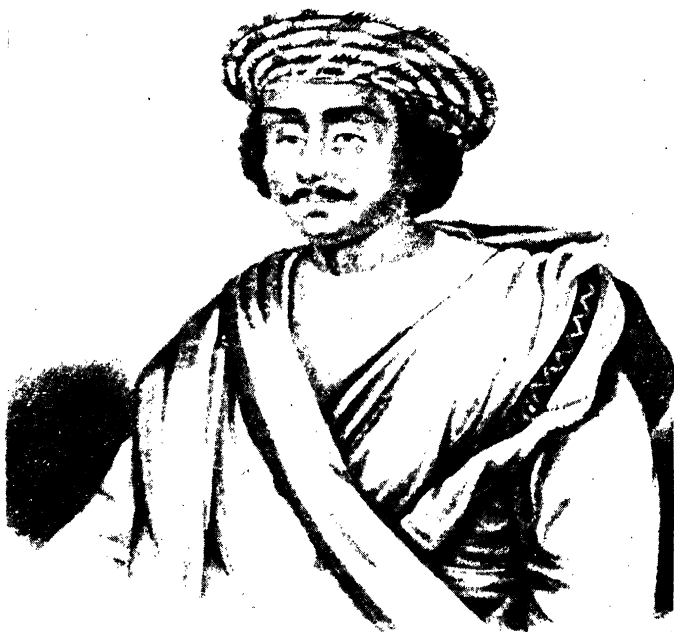
RAM MOHUN ROY