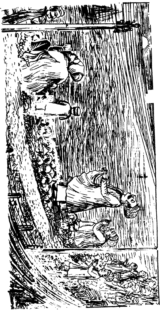
THE ORTHODOX PARSI AT PRAYER.