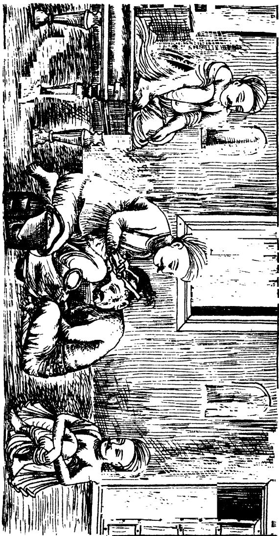
THE HAJAM AT WORK.