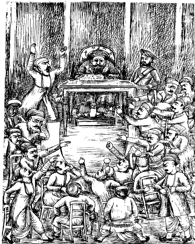
SCENE AT A MILL MEETING.