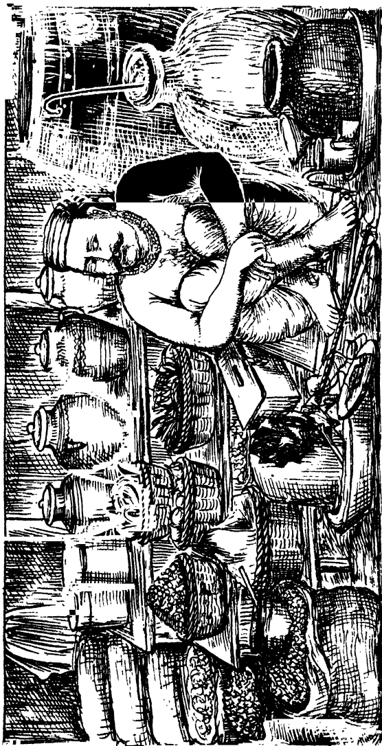
THE MARWARI AT HIS SHOP.