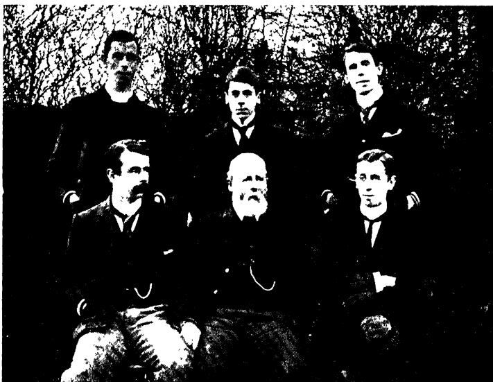
MR. J. E. ANDREWS AND HIS SONS, CHRISTMAS, 1900 (C. F. Andrews standing on the left)