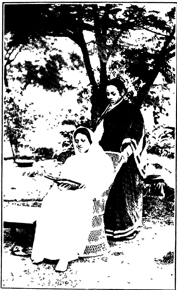
THE PANDITĀ AND MANORAMABĀI