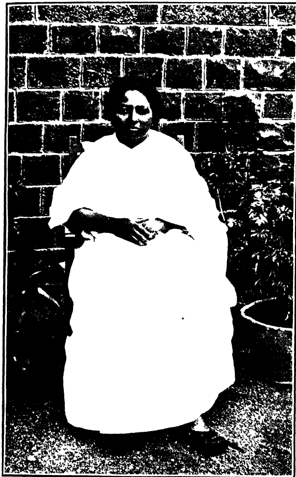
THE PANDITĀ AT MUKTI SADAN (ABOUT 1910)