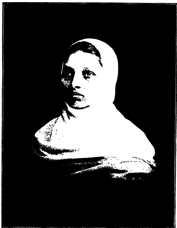
PAṆḌITĀ RAMĀBĀĪ IN 1888