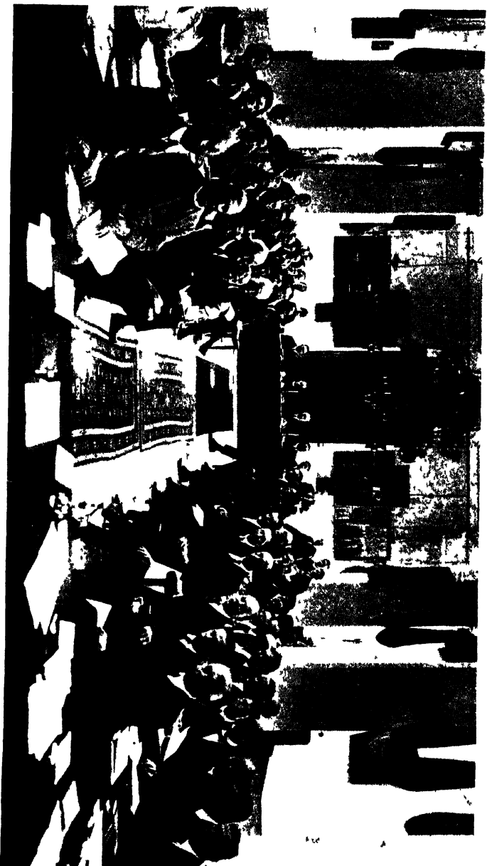
THE GENERAL CONFERENCE IN SESSION IN THE GREEK ORTHODOX CHURCH ON THE MOUNT OF OLIVES